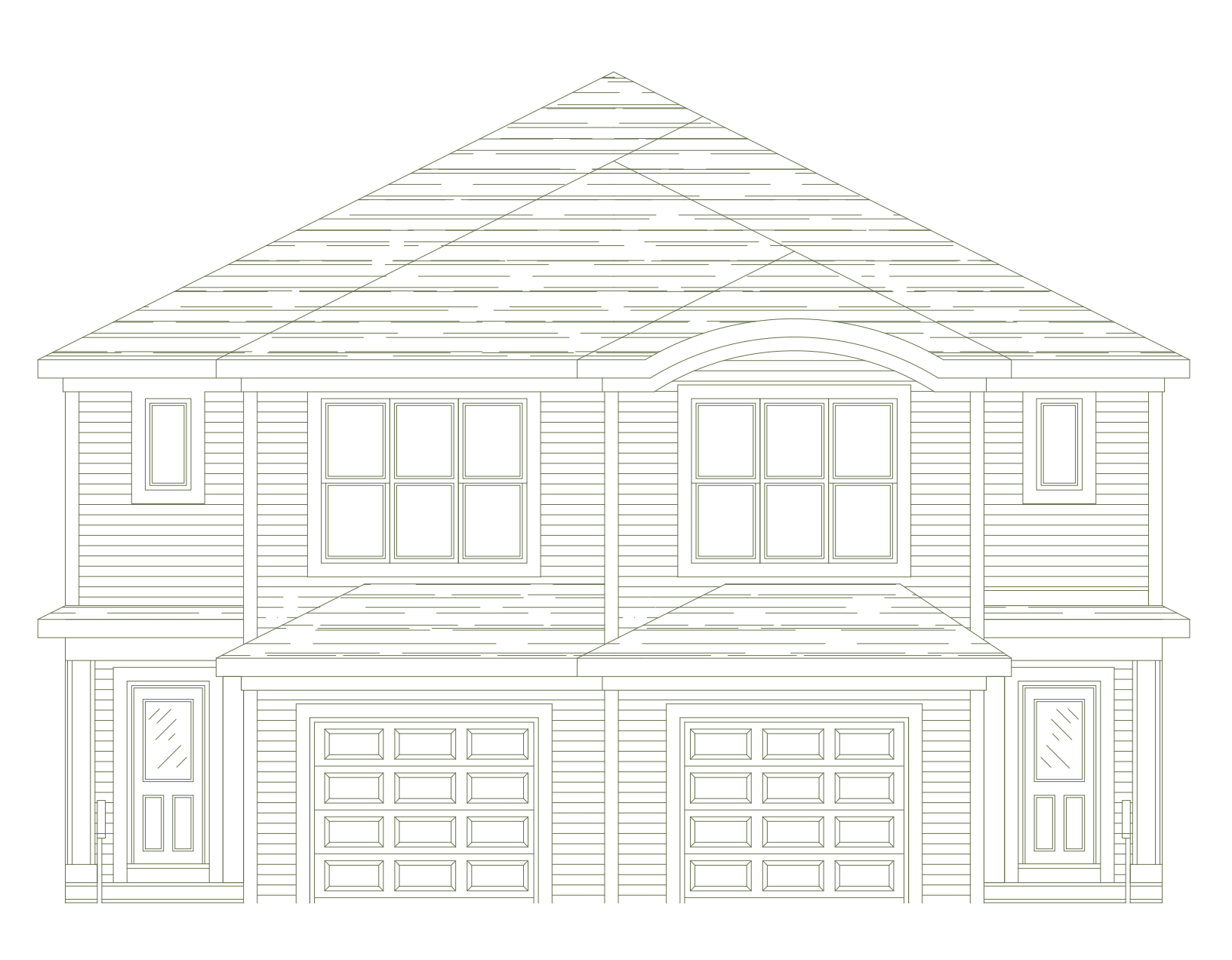
324 Quigley Drive

This 1,531 sq. ft. duplex is guaranteed to satisfy in every way. Boasting an open concept design, the galley kitchen and dining area, coupled with adjoining great room, provide a perfect space for your family to entertain and connect. The beautiful master features a spacious walk-in closet and organizer, as well as a private ensuite with soaker tub and shower. A second-level flex room is the ideal extra space for a TV or games room. An upstairs laundry, back deck and garage are other great features that will make life easier and more enjoyable.