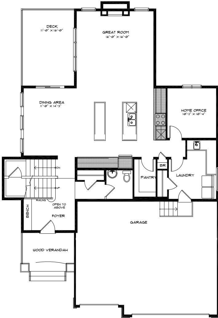
Main Floor 1,377 Sq. Ft.